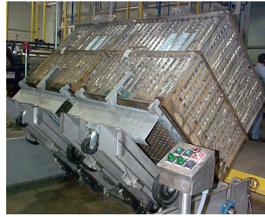
The TIPPER with Self-Contained Controls

Dimensions shown are for one model only. Call Allpax for the model and dimensional information for your retort.